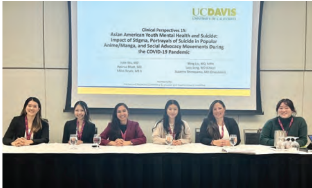
I loved presenting with my UC Davis Co-fellows!