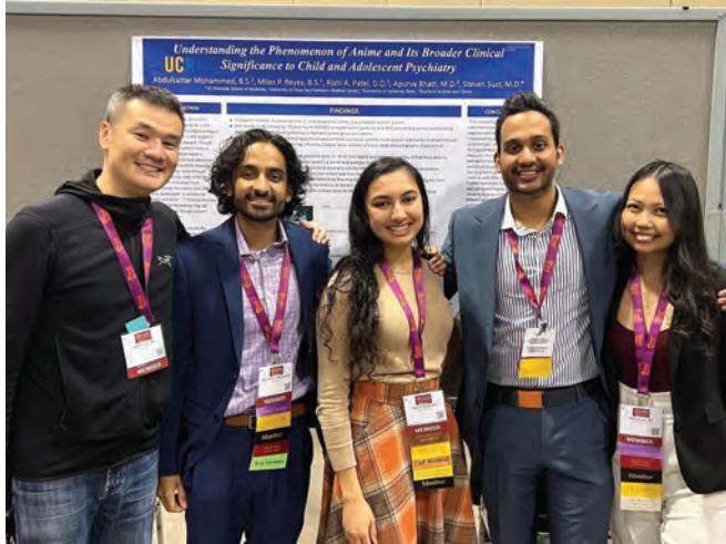
Our poster on anime and CAP was very well received! We took our own Naruto “Team 7” photo.