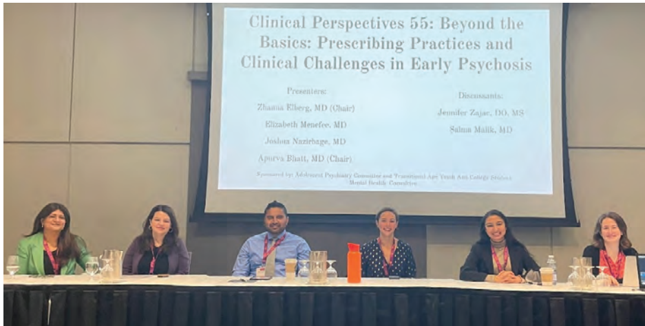
This talk was incredibly well-attended (session was full!) and the discussion ran 60 minutes over because attendees kept asking questions! It was incredible!