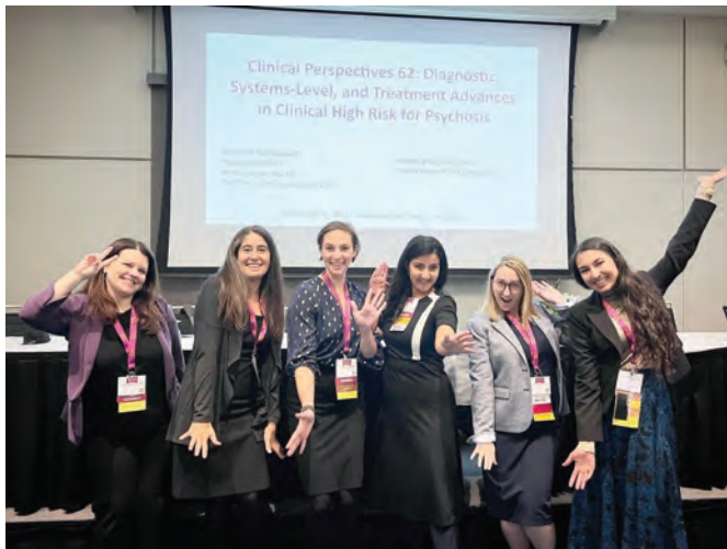
It was an honor to chair this talk among amazing presenters!